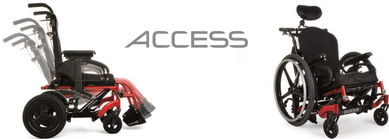
The QUICKIE ACCESS is the only knee-pivot chair with two tilt ranges (-5° to 20° and 0° to 25°).

With an understanding of this research, QUICKIE® developed the Access.