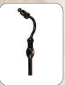
COBRA XTRA Flip-Back