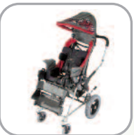
Kid Kart® TLC™