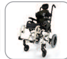
Zippie® TS / TS SE