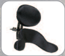
S.O.F.T. Single Sub-Occipital