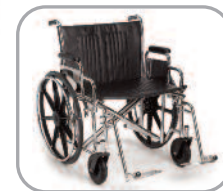
Breezy ® EC 2000 HD