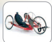
Quickie ® Shark