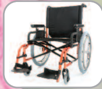
Quickie ® M6 ™