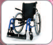
Quickie ® QXi ™