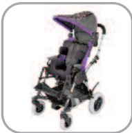
Kid Kart® Xpress™