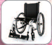
Quickie ® 2