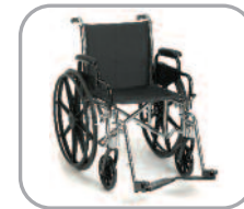
Breezy ® EC 3000