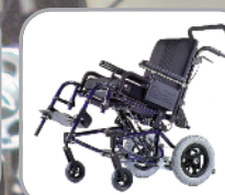
Quickie ® TS / TS SE