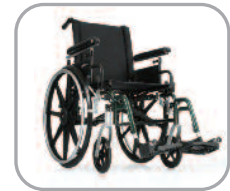
Breezy ® Ultra 4