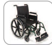
Breezy ® 600