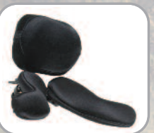
S.O.F.T. Dual Sub-Occipital