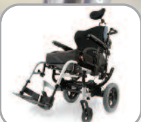
Quickie ® IRIS ™ / IRIS ™ SE

Power Assist is a fantastic option for users who may experience fatigue when self-propelling, but want to maintain the control, functionality and look of a manual wheelchair. Power assist extends the distance traveled and the efficiency of propulsion without the additional physical exertion.