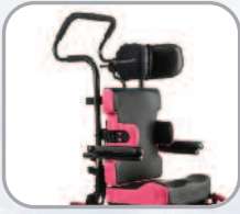
JAY® ConfigureFit™ (includes AES components)