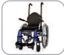
Zippie® GS™ / GS™ SE