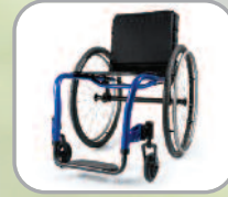
Quickie ® QRi ™