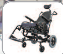
Quickie ® SR45 ™