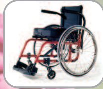
Quickie ® 2 HP ™