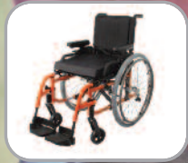
Quickie ® LXI / LX ™