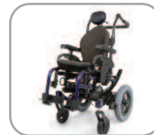
Zippie® IRIS™ / IRIS™ SE

Pediatric rigid wheelchairs are ideal for active and independent children. They are highly responsive, lightweight, and offer precise control, superb balance, and exceptional performance. Pediatric-specific options support children's unique needs, while growth accommodation allows the wheelchair to grow and change as the user's body, lifestyle, environment, and skills change.