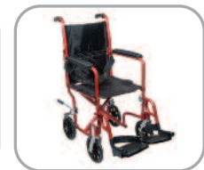
Breezy ® EC Transport