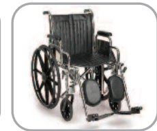
Breezy ® EC 2000