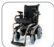
Quickie® P-222 SE