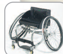
Quickie ® Match Point / Match Point Ti ™