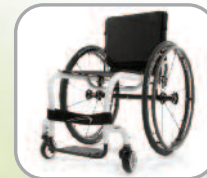
Quickie ® Q7 ™ NextGEN