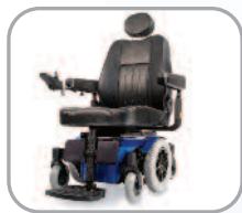
Quickie® Pulse™ Series