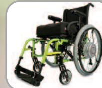
Quickie ® Xtender ™

Rigid Wheelchairs are ideal for active users who know what they want in a wheelchair. They are highly responsive, ultra lightweight and offer precise control, superb balance, and exceptional performance.