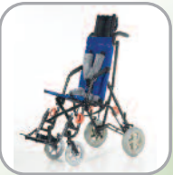
Kid Kart® Mighty Lite™