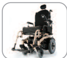
Quickie® S-636 / S-646

Power wheelchairs are designed for users who may experience fatigue when self-propelling a manual wheelchair or whose level of injury may prevent them from being able to self-propel a manual wheelchair. Mid-wheel drive power wheelchairs are extremely responsive and have the smallest possible turning radius, improving accessibility indoors and in tight spaces.