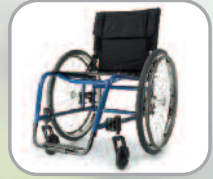
Quickie ® GP ™ / GPV/ GP ™ Swing-away