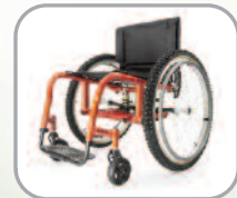
Quickie ® GT ™