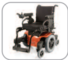
Quickie® QM-7 Series