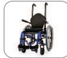
Zippie® GS™ / GS™ SE