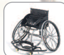
Quickie ® All Court / All Court Ti ™