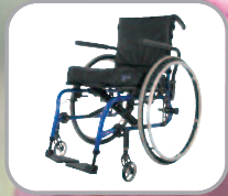
Quickie ® 2 Lite