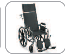
Breezy ® EC 4000 Recliner