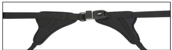
V-Contour Push Button Belt