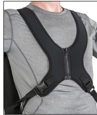
Center Opening with Zipper