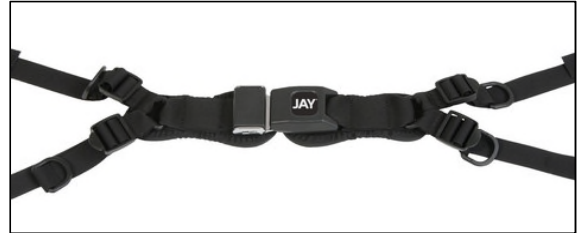
4-Point Padded Push Button Belt