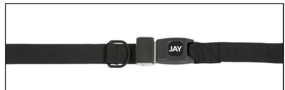
2-Point Push Button Belt