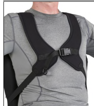
Center Opening with Buckle