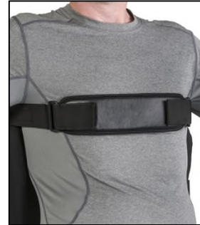
Padded Trunk Strap