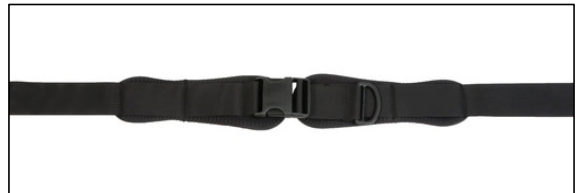
2-Point Padded Side Release Belt