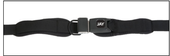
2-Point Padded Push Button Belt